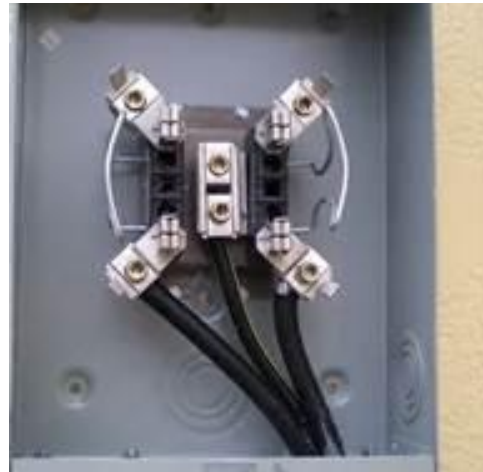
Generic Internet Photo of Meter Base With All Connectors in Like New Condition

Police and Fire Tickets: On November 14, 2012, ComEd began reporting potential involvement of all ComEd meters (both AMI and non-AMI) in fires as indicated by trouble tickets called in to ComEd by police and fire departments. Below is a table that summarizes what ComEd has reported. 10