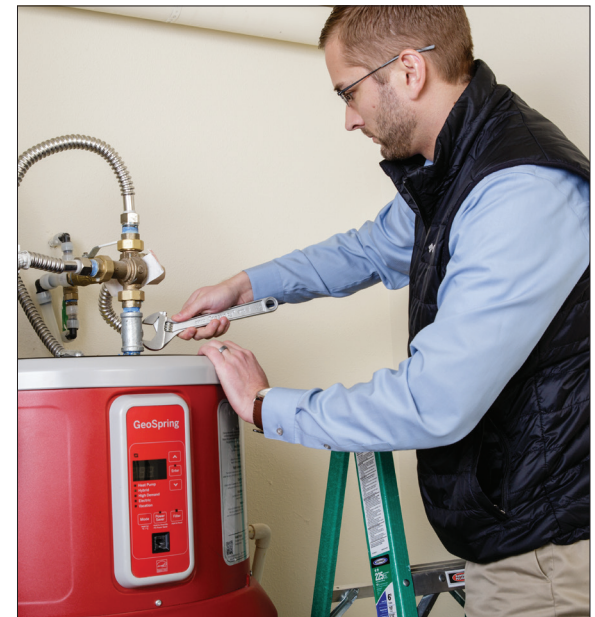
Increasingly popular heat pump water heaters can save energy and money.

Different homes have different installation considerations, so be sure to talk