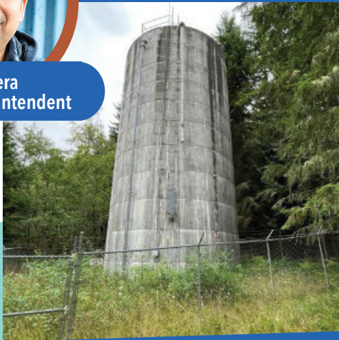
The Gardiner systems upper reservoir.