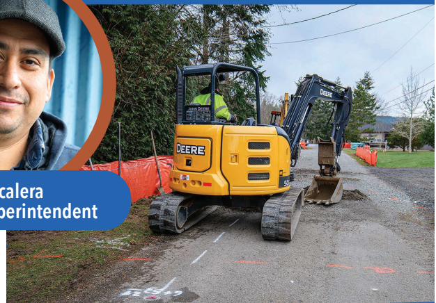
Bywater Bay extension to Margaret Street customers.