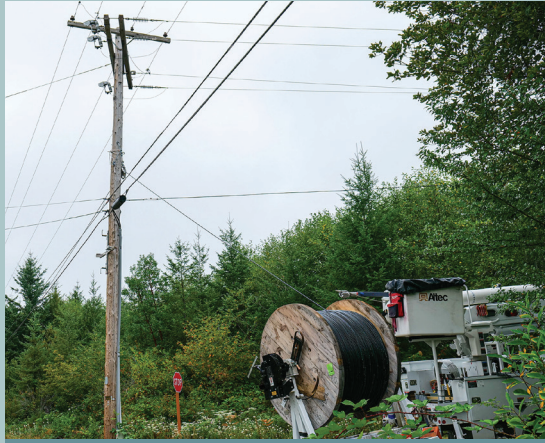
Hanging main line fiber near Quilcene.

Fiber broadband buildout is underway in the Quilcene area. PUD line crews continue installing a mile of fiber a day, with more than 30 miles of aerial main line hung to date.